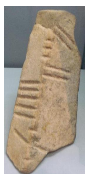
Brookhill Ogham Fragment County Kerry, Ireland Reads: MAQ LUG

Irish Ogham alphabet used on monuments from the 4th - 9th centuries. Names were inscribed on stones from bottom to top using ogham runes. Runes are traditionally associated with the names of trees in Irish.